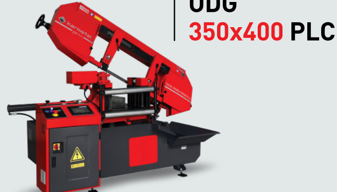
ODG 350x400 PLC