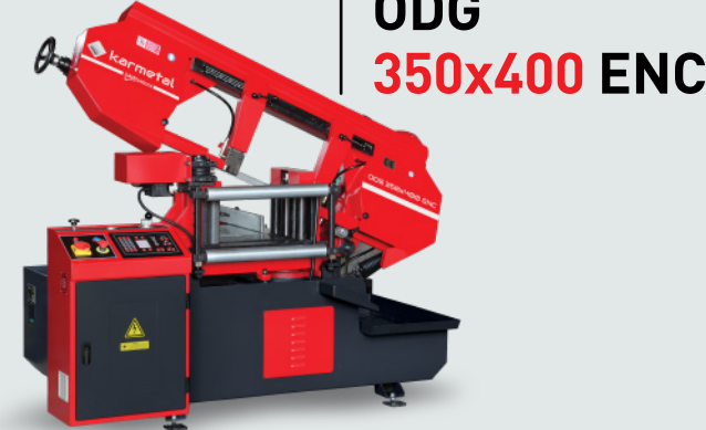
ODG 350x400 ENC