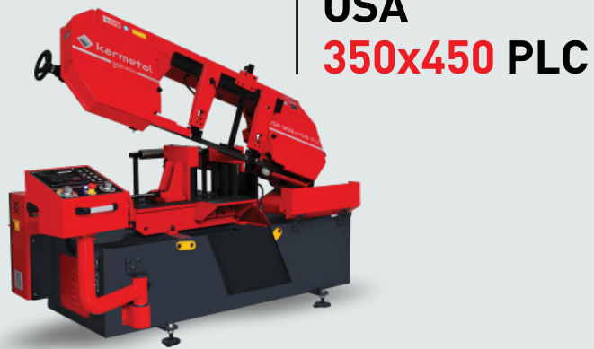
OSA 350x450 PLC