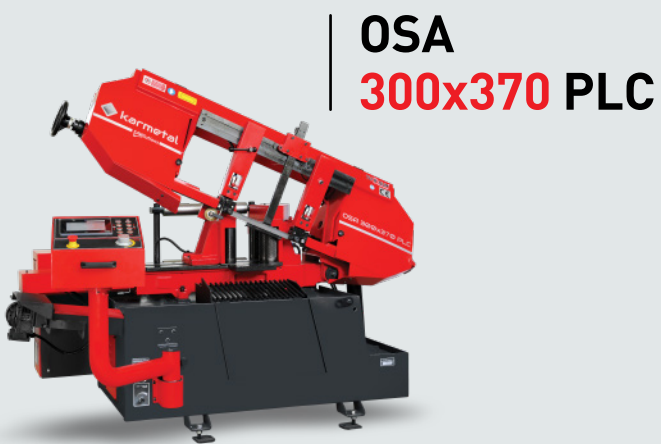
OSA 300x370 PLC