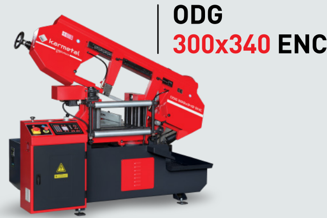
ODG 300x340 ENC