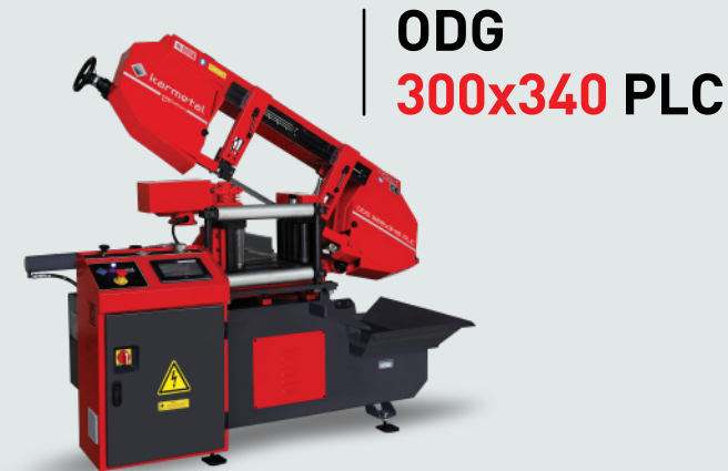
ODG 300x340 PLC