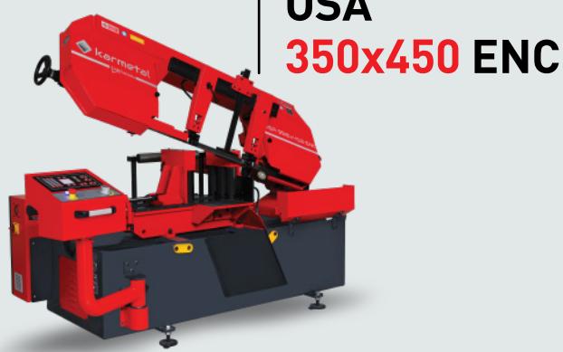
OSA 350x450 ENC