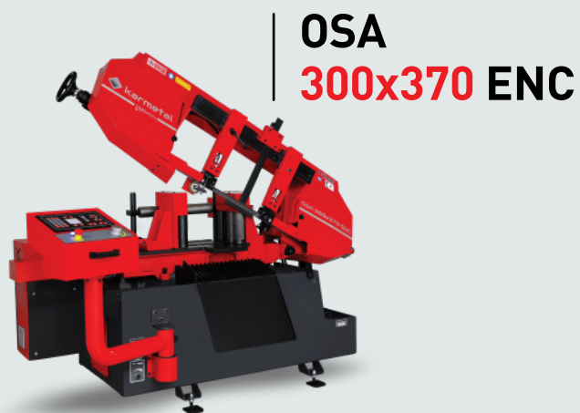
OSA 300x370 ENC